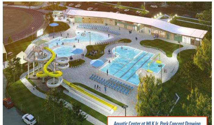
Aquatic Center at MLK Jr. Park Concept Drawing

A fund-raising effort for an additional fenced area at the Randall Park South Dog Park has been initiated. This is