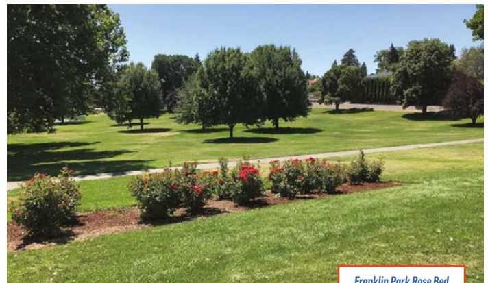
Franklin Park Rose Bed

for dogs that need a little more time to get acclimated. If you are interested in donating to this effort, please let me know. All donations to this project are tax deductible.