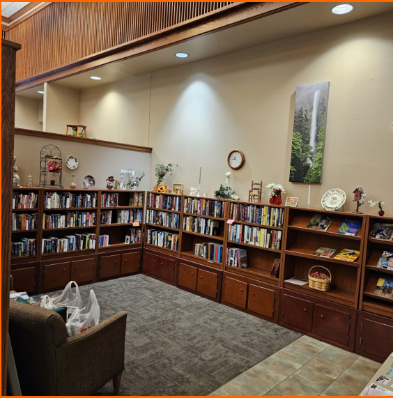
Harman Center Library.