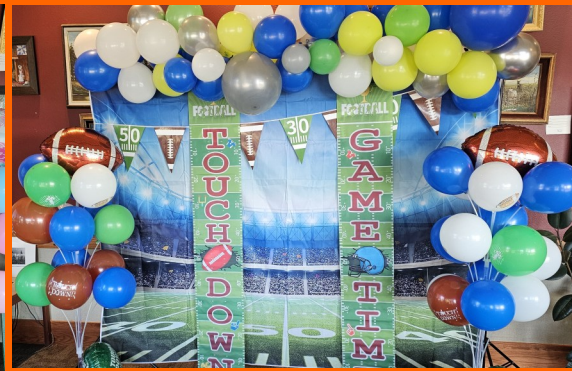
SEPTEMBER PHOTO BOOTH