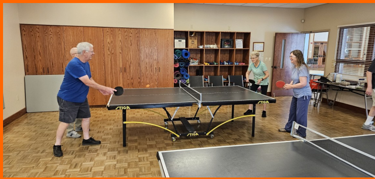
Ping Pong. Bring you "A" game.