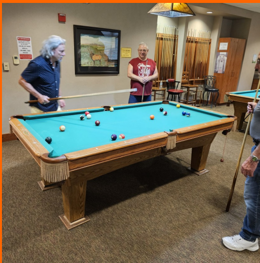
Harman Center Pool Room