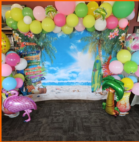
AUGUST PHOTO BOOTH