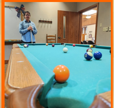
Harman Center Pool Room