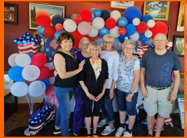
Everyone's loving the new photo booths