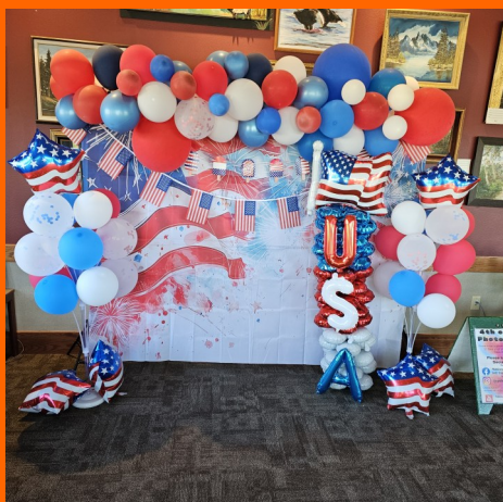
JULY PHOTO BOOTH