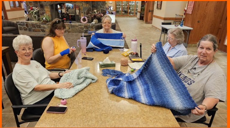
Stitched Together Craft Group. Always a good laugh