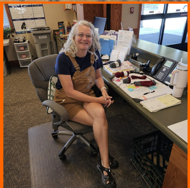
We wish you the best on your future endeavors. Thank you for everything!

Are you turning 65 or new to Medicare and confused? I can help you!